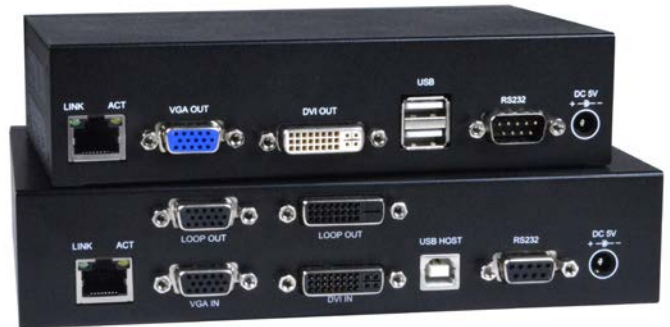
XTENDEX® ST-IPUSBVD-VW (Remote and Local Unit)