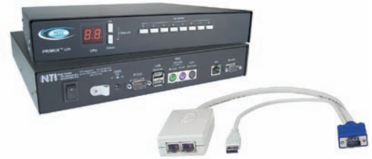
PRIMUM-UZR and HA-USB Host Adapter