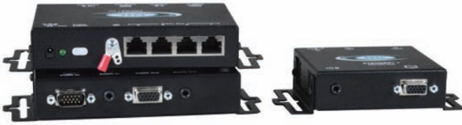
VOPEX-C5VA-4C (Front &amp; Back) and ST-C5VA-600 Remote Unit