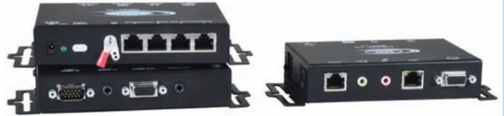
VOPEX-C5VA-4C1000 (Front &amp; Back) and ST-C5V2A-R-1000SP Remote Unit