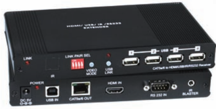
ST-IPUSBH-L-1G and ST-IPUSBH-R-1G