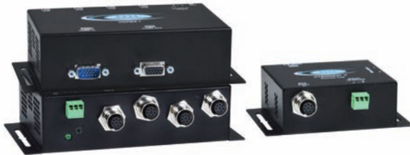
VOPEX-M12V-4 (Front &amp; Back) and ST-M12V-R-600 Remote Unit