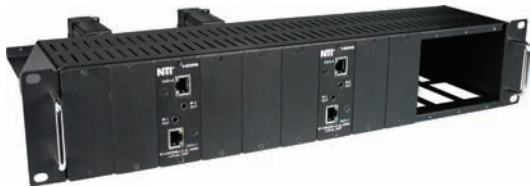
ST-C6RCK-12A with ST-C6HD-LA-2L-300M Extender Modules