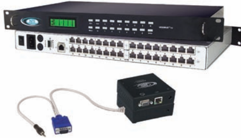
SM-16X16-C5AV-LCD (Front &amp; Back) with a ST-C5VA-L-600 Transmitter &amp; ST-C5VA-R-600 Receiver