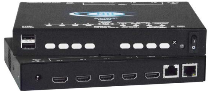
SPLITMUX-HD-4RT (Front & Back)